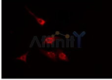
DF2989 staining SW626 cells by IF/ICC. The sample were fixed with PFA and permeabilized in 0.1% Triton X-100, then blocked in 10% serum for 45 minutes at 25°C. The primary Ab was diluted at 1/200 and incubated with the sample for 1 hour at 37°C. An Alexa Fluor 594 conjugated goat anti-rabbit IgG (H+L) Ab (Cat.# S0006), diluted at 1/600, was used as secondary Ab.

IMPORTANT: For western blot, incubate membrane with diluted Ab in 5% w/v milk, 1X TBS, 0.1% Tween@20 at 4°C with gentle shaking, overnight.